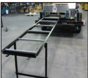
Run Out Table