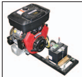
Quick Change Power Pac™