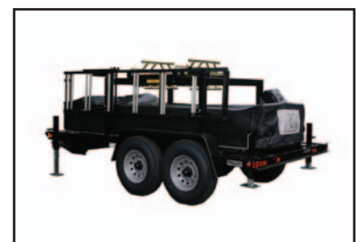
Machine with Cover