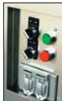
Push Button Controls