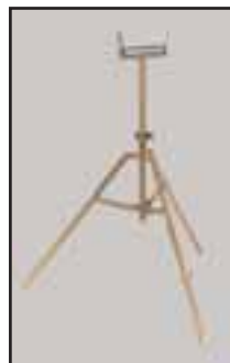
Run Out Stand